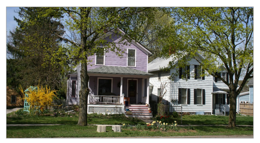
814 W Liberty, May 2008 survey photo

ATTACHMENTS: application, photos, drawings, materials details